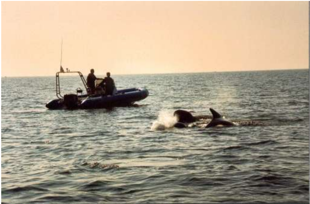
Figure 10.2.2 Long-finned Pilot Whales off Fermain, Guernsey by Tony Rive

The waters around the Bailiwick of Guernsey (the REA study area), are used by a diverse range of cetaceans. The area offers a variety of habitats in close proximity as well as areas of high productivity. Despite the abundance and diversity of cetaceans in local waters our knowledge of the abundance and particularly the population structures and conservation status of these animals remains remarkably basic.