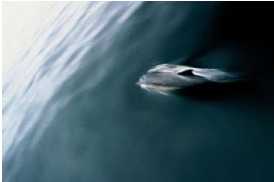
Figure 10.2.4 Common Dolphin by Mike Cave

Cetacean eyes are placed on both sides of the head and so give a more panoramic view. The visual fields do overlap, but binocular vision has yet to be demonstrated.