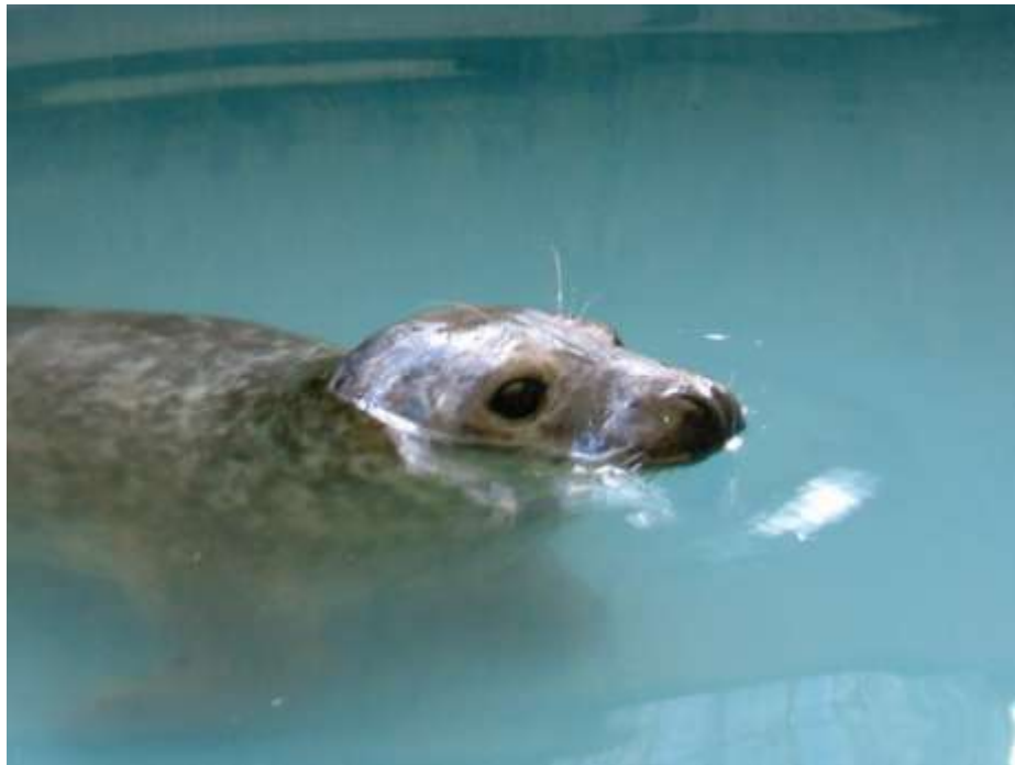
Figure 10.2.1 Atlantic Grey Seal pup (M J Gavet)

come ashore during the breeding season to give birth, and at other times to moult their fur. The distribution of seals around the coast and the timing of lifecycle (pupping and moulting) will be potentially important considerations for the timing of marine renewable energy device deployment.