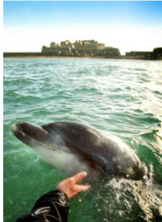
Figure 10.1.1 Bottlenose Dolphin (Chris George)

The Bailiwick has the second highest tidal range in the world at over 10 metres or 33 feet on spring tides, the highest tidal range being in the Bay of Fundy in Atlantic Canada. The ebb and flow of the tide therefore means that strong currents increase the flow of nutrients around its waters, causing marine life and key prey species to flourish (e.g. mackerel and sea bass). This in turn attracts animals higher up the food-chain, including cetaceans (dolphins and whales) and pinnipeds (seals).